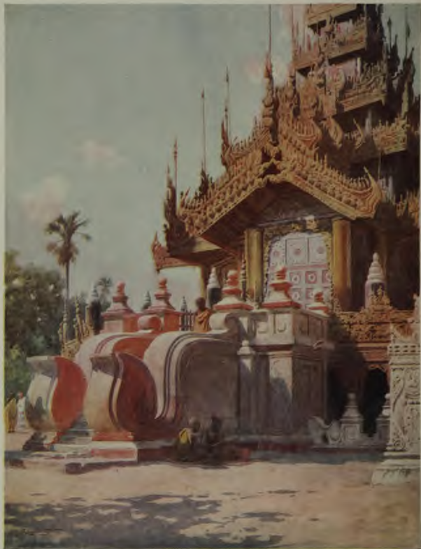
THE QUEEN'S GOLDEN MONASTERY, MANDALAY. Page 79.